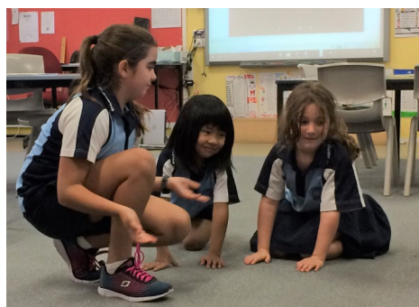
Role play in our Religion Lessons