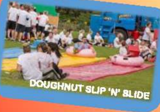
DOUGHNUT SLIP 'N' SLIDE