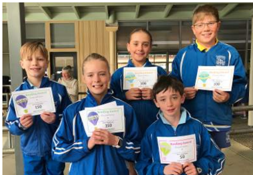
Reading award winners.