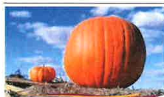
You can make your savings really grow!

Take advantage of ADIG's long term savings accounts & watch your money grow. From Student Saver's to Fixed Term Investments, our competitive rates can help you reach your savings goals.